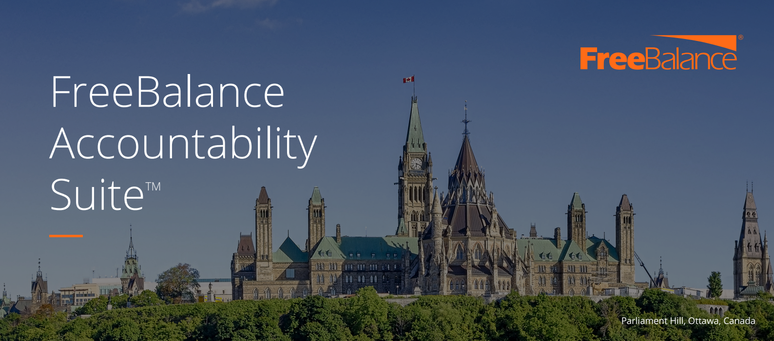
Parliament Hill, Ottawa, Canada

The FreeBalance Accountability Suite™ is available in six base configurations to meet different Government Resource Planning (GRP) requirements